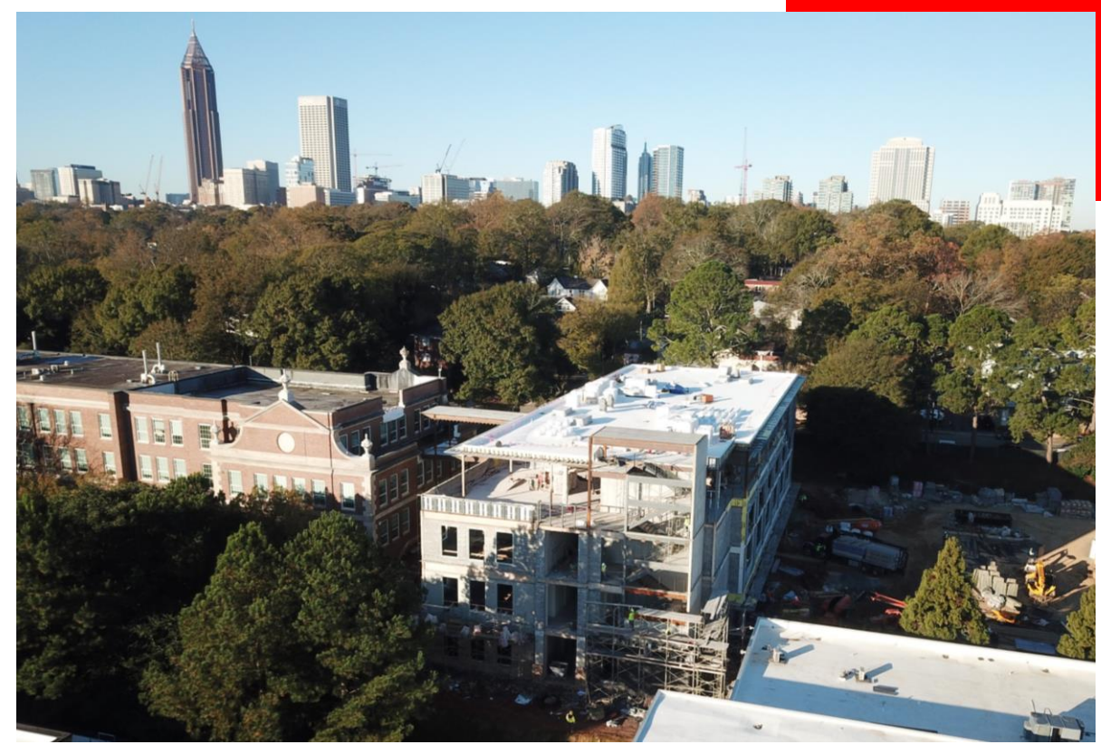
New Addition Progress