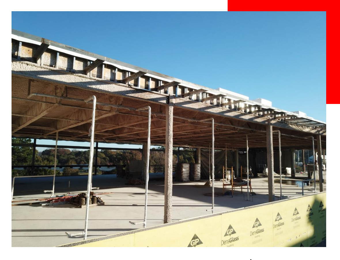
Fireproofing Progress at 4<sup>th</sup> Floor of New Addition