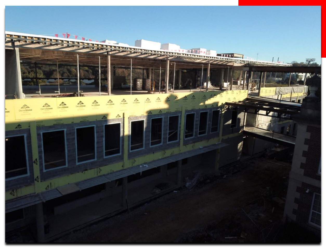
Exterior Sheathing Completed at South Side of New Addition