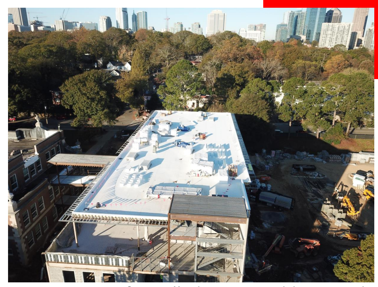
New TPO Roof Installed at New Addition and Rooftop Curbs Set for new HVAC Units