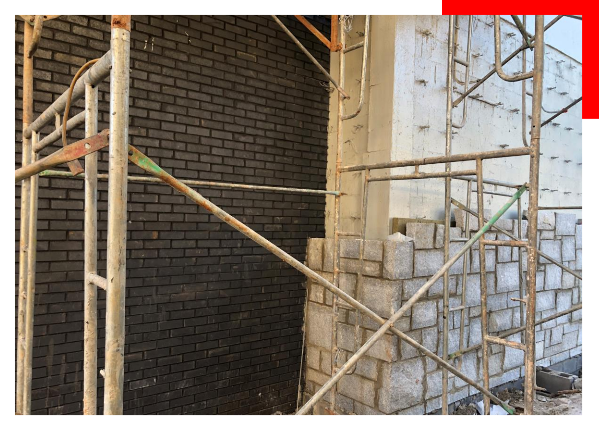
Black Brick and Granite Progress at North East Corner